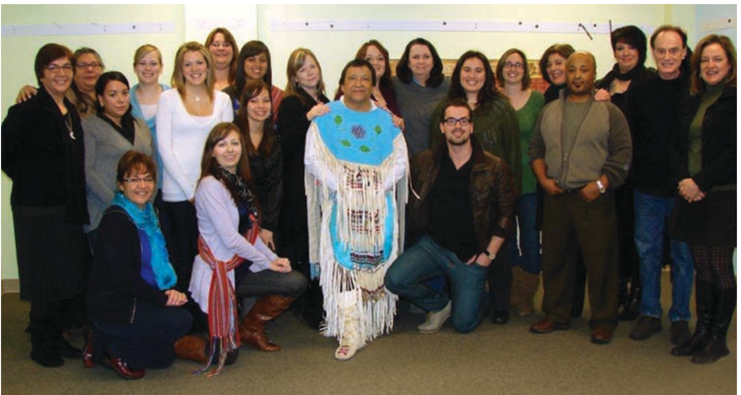
ASW Graduation – Students and staff, February 18, 2011