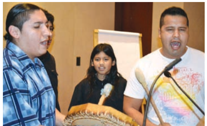
Love Medicine drummers